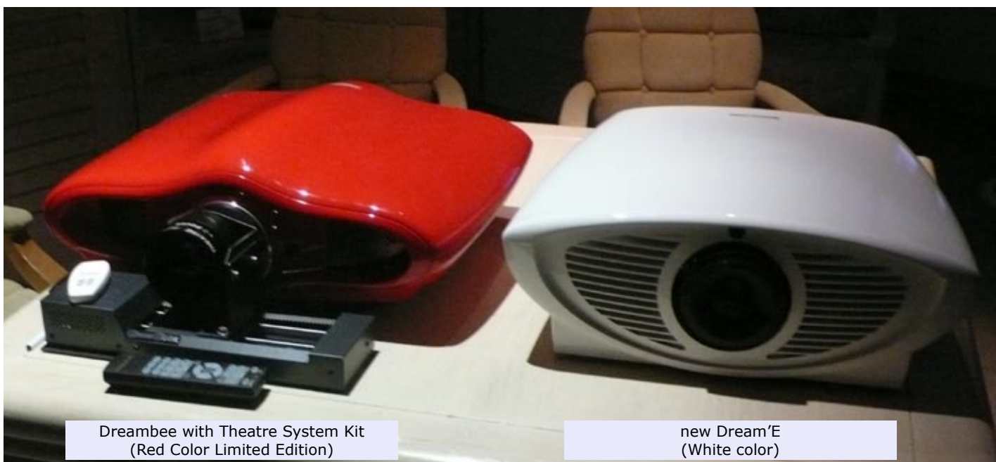
Dreambee with Theatre System Kit (Red Color Limited Edition)