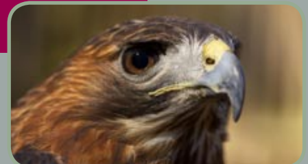
The Wide System uses every available pixels to display a 2.35 movie.

The Wide System is optimized for the latest Blu-ray and DVD formats such as 2.37:1 or 2.40:1 "True Cinema 1080p24". No more unpleasant black bars on top and bottom. Just sit comfortably, relax and enjoy the show in a true Cinemascope format.