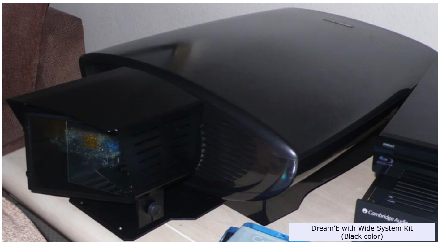
Dream'E with Wide System Kit (Black color)