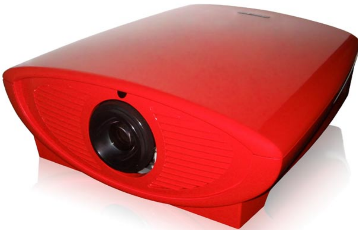
Dream'E Life in red

Step by step, the DreamVision design team will release some new colors. Specific colors (based on RAL classification) can also be studied on demand. Since the Life collection is assembled and painted in France, it will ship out ex-Paris.