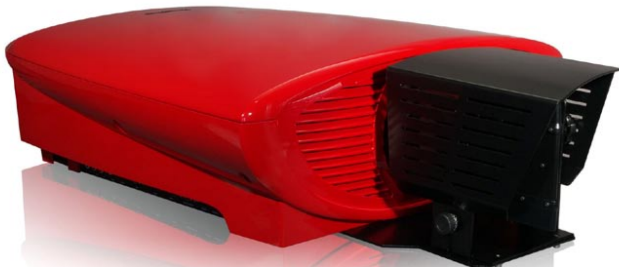
Dream'E Life with (optional) Wide System Kit